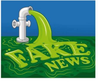
A Parent's Guide to Fake News