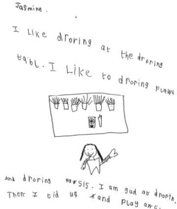
Writing - End of Reception